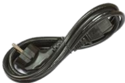
2 IEC cords