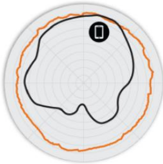
Figure 2. T750 2.4GHz Azimuth Antenna Patterns