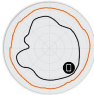
Figure 3. T750 5GHz Azimuth Antenna Patterns