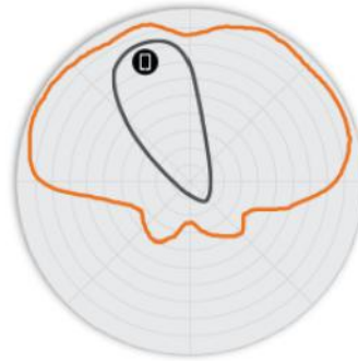
Figure 4. T750 2.4GHz Elevation Antenna Patterns