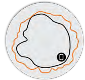
Figure 4. R760 6GHz Azimuth Antenna Patterns