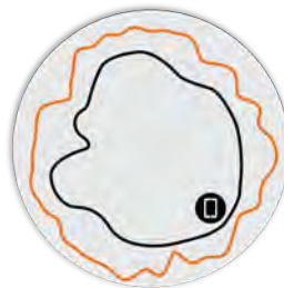
Figure 3. R760 5GHz Azimuth Antenna Patterns