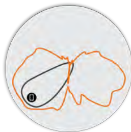
Figure 6. R760 5GHz Elevation Antenna Patterns