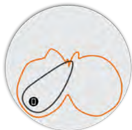
Figure 5. R760 2.4GHz Elevation Antenna Patterns