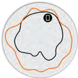
Figure 2. R760 2.4GHz Azimuth Antenna Patterns