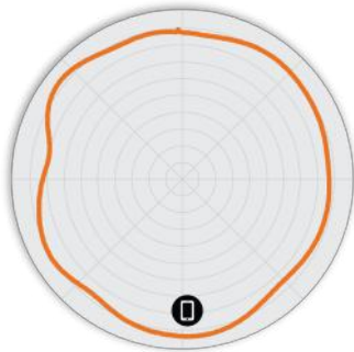
Figure 2. R550 2.4GHz Azimuth Antenna Patterns