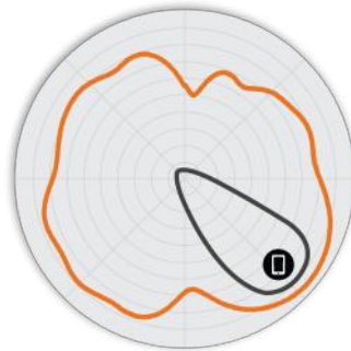
Figure 4. R550 2.4GHz Elevation Antenna Patterns