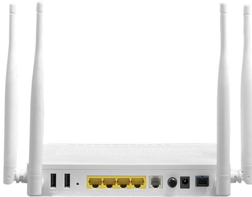
Picture 2-1 EN41AC product figure