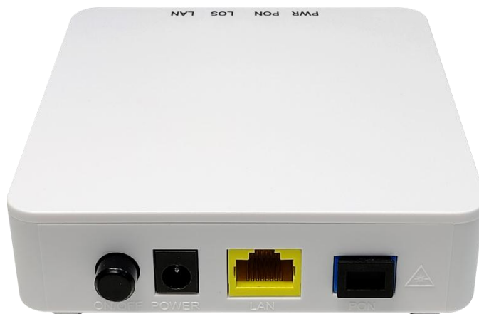
Picture 2-1 GN10 product figure