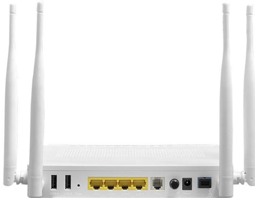
Picture 2-1 GN41AC product figure