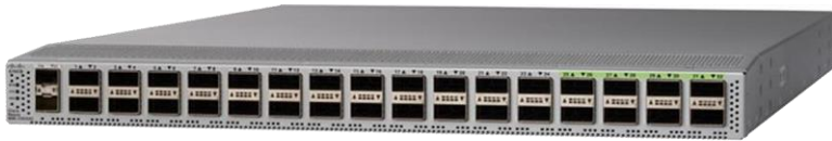
Figure 3. Cisco Nexus 9332C Switch

The Cisco Nexus 9332C is the smallest form-factor 1-Rack-Unit (1RU) spine switch for Cisco ACI that supports 6.4 Tbps of bandwidth and 2.3 bpps across 32 fixed 40/100G QSFP28 ports and 2 fixed 1/10G SFP+ ports (Figure 3). Breakout is not supported on ports 1 to 32. The last 8 ports marked in green support wire-rate MACsec encryption 2 .