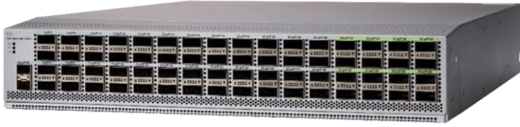
Figure 2. Cisco Nexus 9364C Switch

The Cisco Nexus 9332C is the smallest form-factor 1-Rack-Unit (1RU) spine switch for Cisco ACI that supports 6.4 Tbps of bandwidth and 2.3 bpps across 32 fixed 40/100G QSFP28 ports and 2 fixed 1/10G SFP+ ports (Figure 3). Breakout is not supported on ports 1 to 32. The last 8 ports marked in green support wire-rate MACsec encryption 2 .