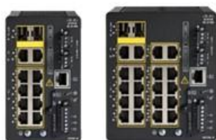
Figure 2. IE-3105 Rugged Series switch models with enhanced feature set