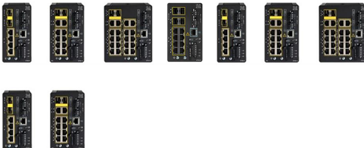
Figure 1. IE-3100 Rugged Series switches models