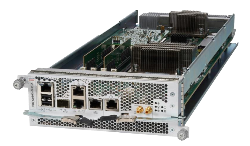
Figure 2. Cisco Nexus 9800 supervisor (1st Generation)

The Cisco Nexus 9800 Series supports a 36-port 400G QSFP-DD line card. The QSFP-DD ports are also backward compatible with QSFP28 and QSFP+ modules. This line card provides up to 14.4 Tbps capacity with at least seven fabric modules. If the chassis is configured with eight fabric modules, the chassis would provide 7+1 fabric module redundancy to this line card. This line card also supports line rate MACsec encryption on all ports. Furthermore, each 400G port also supports 2x 100G, 4x 100, 4x 25, and 4x 10G breakout options.