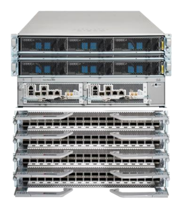
Figure 1. Cisco Nexus 9800 8-slot chassis and 4-slot chassis