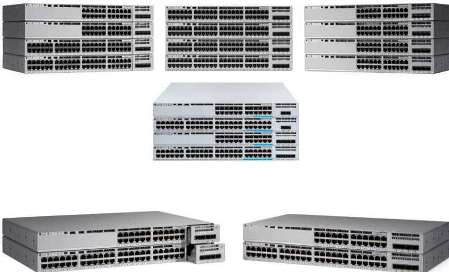
Figure 1. Cisco Catalyst 9200 Series switches

The Cisco Catalyst 9200 Series is made up of modular (C9200) and fixed (C9200L) switch models.