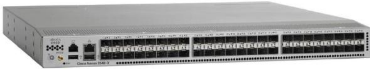
Figure 7. Cisco Nexus 3548-XL and 3524-XL Switch

The Cisco Nexus 3548-XL and 3524-XL have the following hardware configuration: