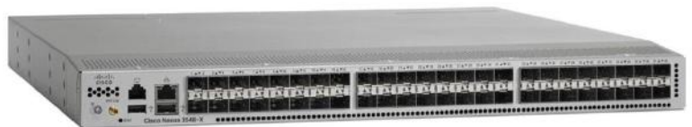
Figure 4. Cisco Nexus 3548-X and 3524-X Switches

The Cisco Nexus 3548-X and 3524-X have the following hardware configuration: