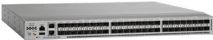
Figure 1. Cisco Nexus 3548 and 3524 Switch

The Cisco Nexus 3548 and 3524 have the following hardware configuration: