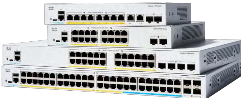
Figure 2. Cisco Catalyst 1300 Series switches

The Cisco Catalyst 1300 Series Switches are fixed, managed, enterprise-class Gigabit Ethernet Layer 3 switches designed for small and medium-sized business and branch offices. These simple, flexible, and secure switches are ideal for deployment out of the wiring closet. The Catalyst 1300 Series operates on customized Linux OS software, with an intuitive dashboard that simplifies network setup and advanced features that accelerate digital transformation, while pervasive security protects business-critical transactions. The 1300 Series switches provide the ideal combination of affordability and capabilities for small and medium-sized businesses and help you create a more efficient, better-connected workforce. When your business needs advanced networking features and security for the digital transformation, yet value is still a top consideration, you're ready for the Cisco Catalyst 1300 Series Switches.