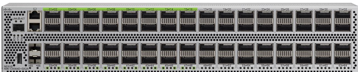
Figure 1. Cisco Nexus 9364D-GX2A switch

The Cisco Nexus 9364D-GX2A is a 2-Rack-Unit (2RU) switch that supports 51.2 Tbps of bandwidth and 8.35 bpps across 64 fixed 400G QSFP-DD ports and two fixed 1/10G SFP+ ports (Figure 1). QSFP-DD ports also support native 200G (QSFP56), 100G (QSFP28) and 40G (QSFP+). Each port can also support 4x10G, 4x25G, 4x50G, 4x100G, and 2x200G breakouts. The first 16 ports, marked in green, are capable of wire-rate MACsec and Cloudsec encryption. The switch is best suited to support massive scale-out fabrics as a compact, high-density spine.