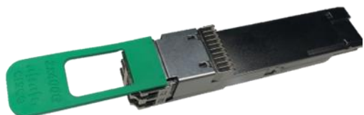
Figure 2. QDD-2X400G-FR4

The Cisco QDD-2X400G-FR4 module ( Figure 2 ) supports link lengths of up to 2 km SMF with two duplex LC connectors. It is compliant to IEEE 802.3cu for 400GBASE-FR4 requirements and 100G Lambda MSA group. The 400 Gigabit Ethernet signal is carried over four CWDM grid optical wavelengths. Multiplexing and demultiplexing of the four wavelengths are managed within the device. FEC is performed on the host platform.