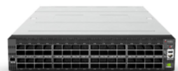
SN5600 switch image